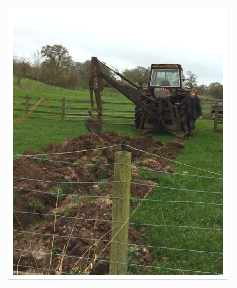
Steve Wilman using a bucket attachment on his tractor to dig the 160 metre long trench

The route was over rocky ground and couldn't be mole ploughed but had to be carefully trenched. After two days digging the trench was ready to have the ducting placed within it, done carefully to ensure that it was protected from compression by heavy boulders and rocks that might be present in the backfill.