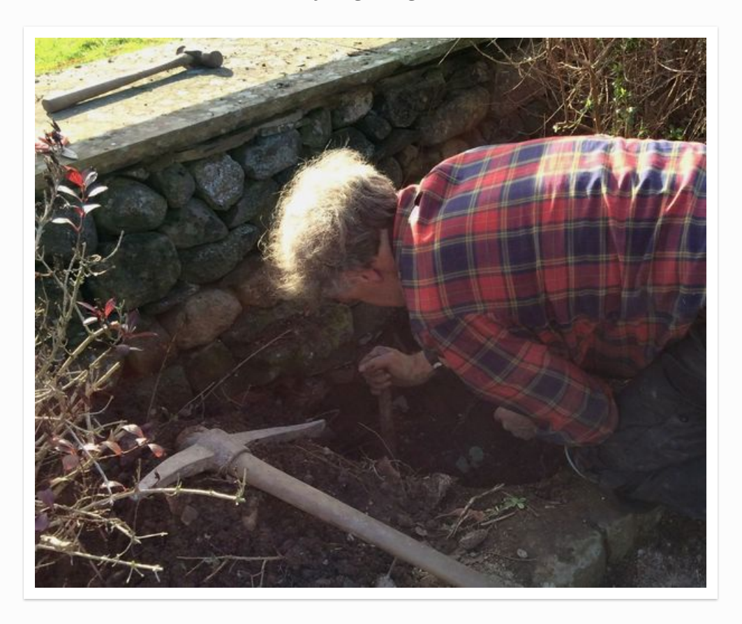
Chris Benson successfully finds the way through!

A blue protective sheath is fed through to provide a safe route for the ducting.