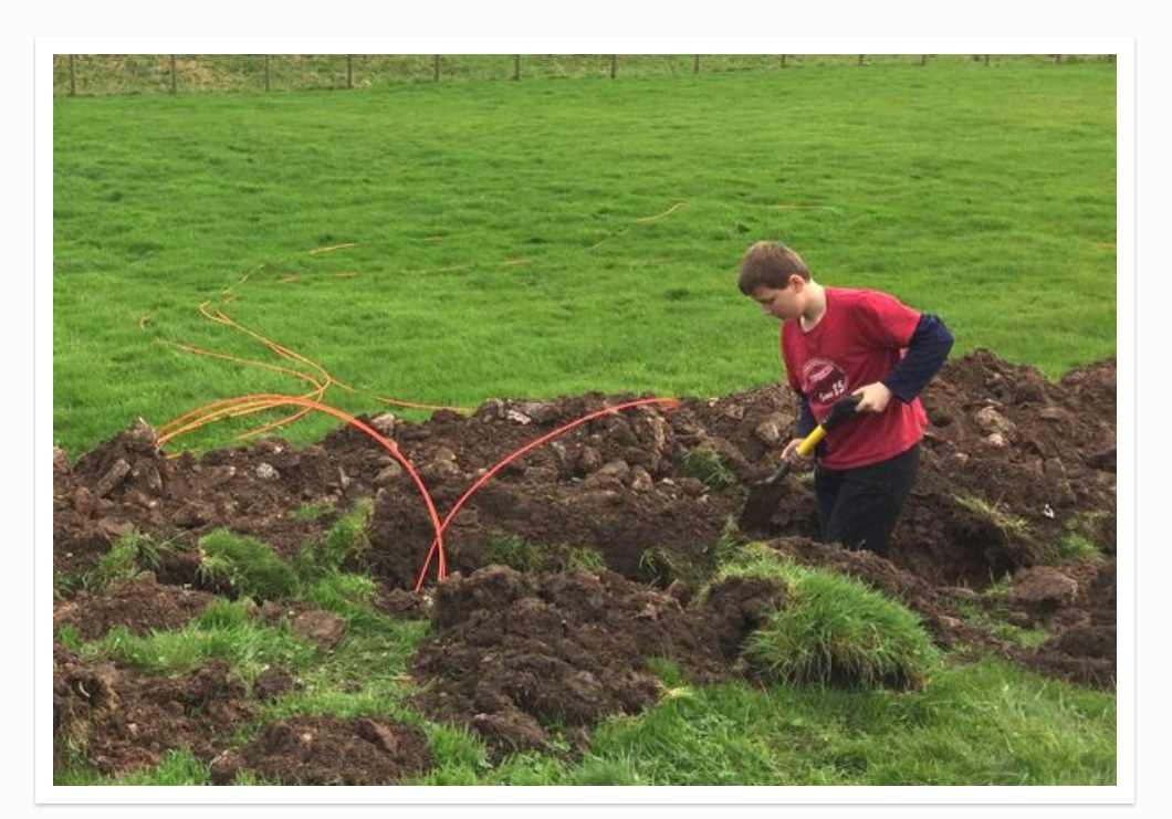
William Mawdsley, on half term holiday, smoothing the bottom of the trench before the ducting was laid

The ground was so uneven that the bottom of the trench had to be cleared of rubble before the ducting was placed there. The duct was then covered with soft turf to protect it from any heavy stones which might be in the earth when it was back filled.