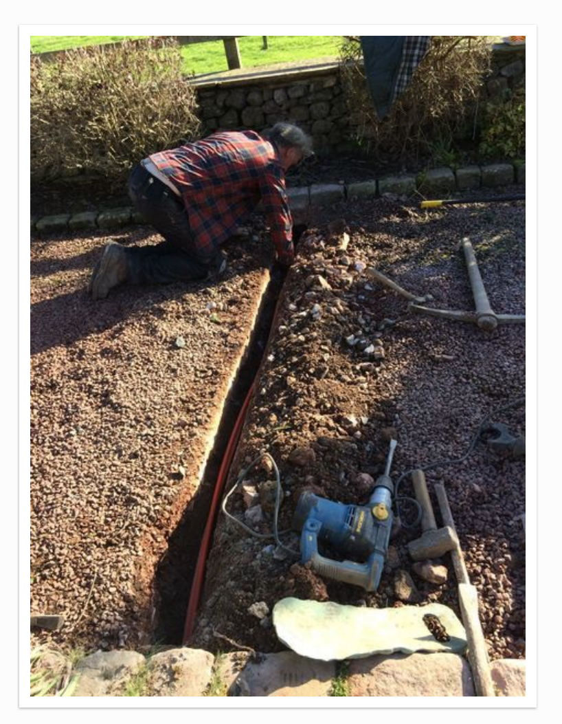
A neat channel across the driveway

It's remarkable how easy it is to reinstate this kind of drive with the simplest of tools!